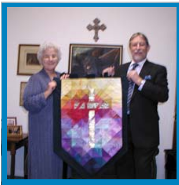
The Revelation was read aloud with John!

Then, for the next seven weeks we will ponder the question: "What is Jesus Calling His Church to Become?" If Jesus sent us a letter how would we respond?